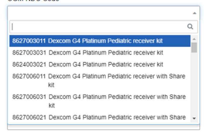
CGM NDC Code ·

Users can search the NDC field by brand name. Entering the NDC will assist in streamlining automated approval process.